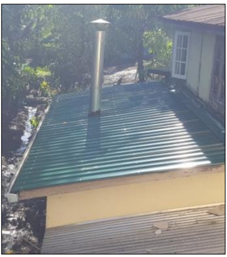
The new roof after installation

Many of our former students are still living in great fear and hopelessness! They are afraid to attend school as they and their families were warned to not return to school by some of the opposition political leaders.