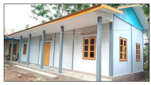
Hope Preschool—New Building

We started the paperwork for the new building construction on January 14th, 2022. We began laying the foundation on January 19th, 2022. Our construction team worked very hard during the civil war. We finally were able to hold the new building dedication service on July