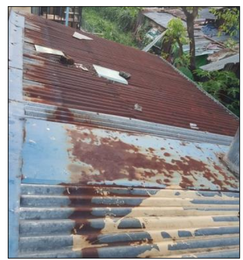
The old roof was in bad shape.

ing School. Many parents were also afraid to send their children back down to Yangon. However, by June of 2022 things had calmed down enough that we decided to reopen on a limited basis. So we reopened HBS with thirteen students.