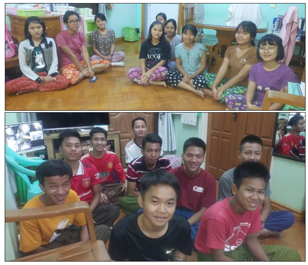
The students who have returned to Hope Boarding School in 2022

In the 2023-2024 academic year, which starts in June 2023, we are praying to accept more students. We want to now accept students from any state or region, up to fifty students total. These must be young people who are really ready and willing to go to school and do the hard work required to catch up and be able to graduate high school. We are now in the planning stage of accepting students from every Region or State in Myanmar, and not just from the northwest as in