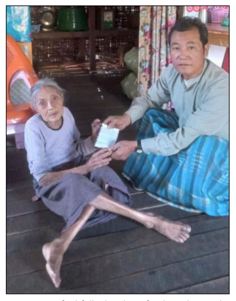
Our pastors faithfully distribute funds to the needy

We are so thankful for all the monthly support for MyHope ministries. We would like you to know that we regularly distribute funds to about ninety individuals and families with the donations to the Family Support Program. Because of your love, many poor disabled persons, orphans, widows, widowers, blind, lame, and sick can have food for their living!