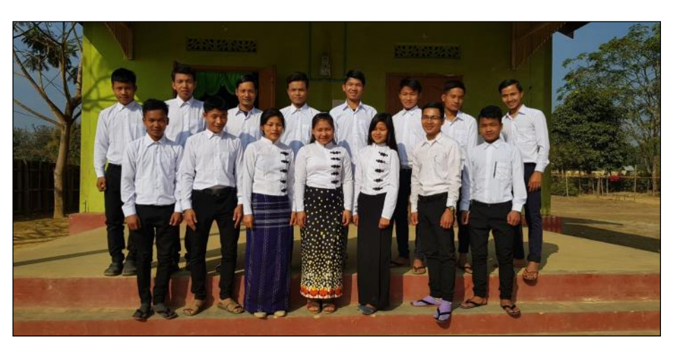
Hope Theological Seminary—Future Leaders