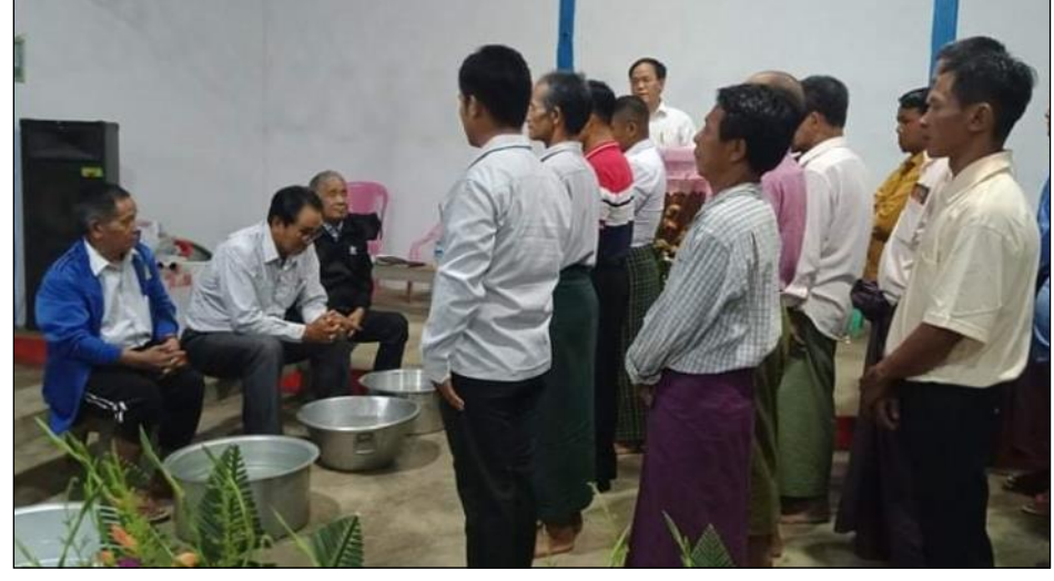
Washing the feet of the pastors and elders

This new clinic will be meeting a great need for the several hundred families in and around this camp.