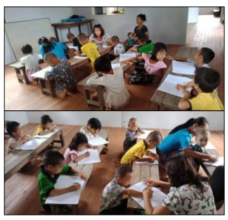
Learning in the new classrooms

Whenever the civil war is over, the school will be able to take care of around fifty children.