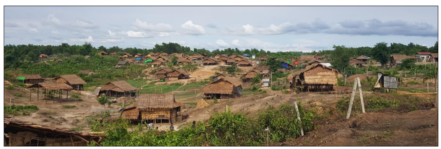
Wetinpauk Refugee Camp

We joyfully dedicated the new building on November 6, 2022. The size of the new building is 63 feet long and 28 feet wide.