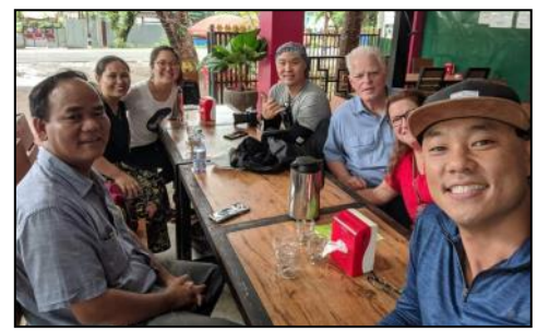
Sharing breakfast together

Saturday, over 120 pastors, elders, and women leaders gathered at Namihan Church for a weekend of teaching on discipleship and church leadership.