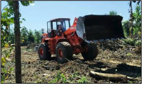
The bulldozer clearing out logs and brush

Palal is also currently evaluating different options for irrigating the farm. It appears at this point that the best option will be to machine dig a deep well, drop in a solar-powered pump, and put up a large water tank. From there we can run water lines out to the areas that need irrigation the most.