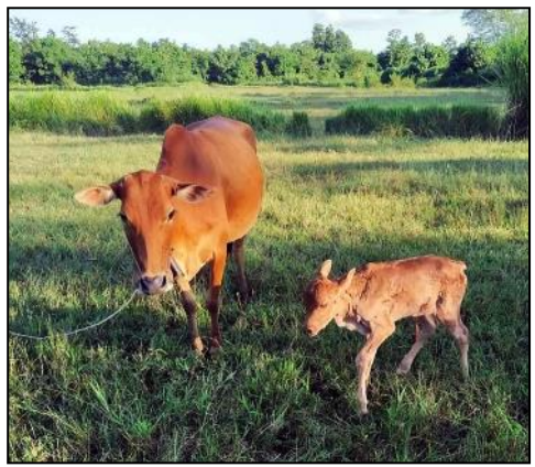
Another female calf was born

On the night of November 1st, another new female calf was born! Now we have nine cows in our little herd.