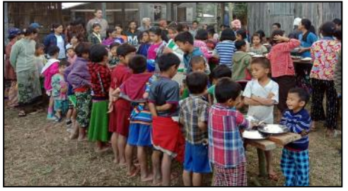
Children of Khumnoi enjoying a Christmas meal

As you prepare for the holidays, are you thinking about how you can bless the poor this Christmas? We have a program called "Village Christmas Meals" that provides a very tangible blessing each year for many people living in extreme poverty.