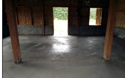
Putting a concrete floor in the new barn how to mix, pour, and level concrete from someone experienced in that trade. Together they put a concrete floor in our barn, which will greatly help to keep the crops, seed, and other equipment dry and safe from vermin.