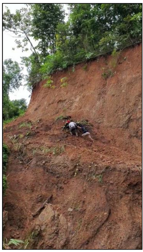
Navigating a landslide

The results of their herculean efforts are astounding, exceeding our best and wildest imaginings. It may be that by the time this newsletter is published we will have posted the videos on the Internet. If so, the links to the videos will be on our website, Facebook page, and in the email that accompanies the newsletter.