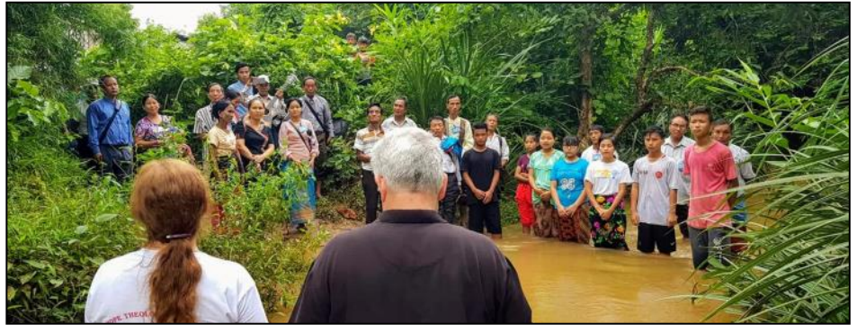
Baptizing young believers in a nearby stream

Even if you can't go, your prayers can, and we really need your prayers during our trips. The enemy does not want