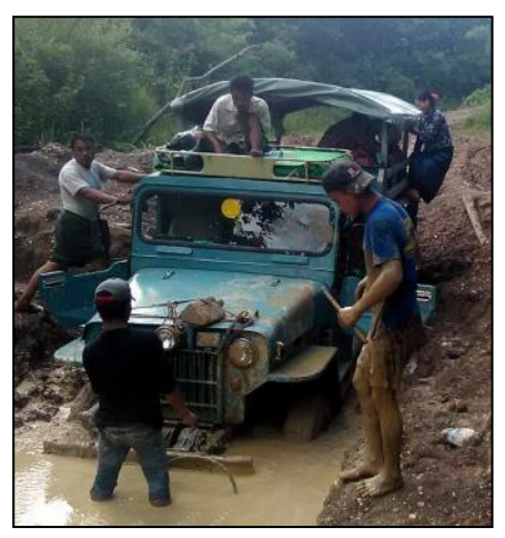
Trying to navigate the mountain "roads"

Our dedicated volunteers risked their lives to bring rice to this very remote village. They had to drive on rainsoaked mountain paths that were kneedeep in mud. They had to ride on cargo river boats which are notorious for capsizing. And then they and the villagers had to haul the rice on their backs up the side of a mountain to get to the village.