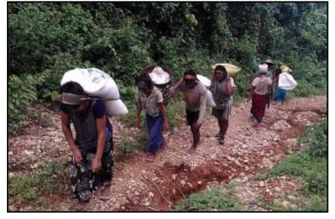
Hauling the rice up to the village from the river

The villagers were overjoyed when they saw the answers to their prayers. This is the first time they have ever received any help from Christians in America. They said their faith in God was increased as He responded to their cries and prayers by sending help from believers in the States. Now the needy villagers have enough food to keep them alive until their next harvest.