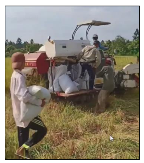
Harvesting rice at the East/West Garden

We are so thankful for the bountiful harvest, and for all of the prayers and donations that make our farm possible. Your love gifts have purchased equipment like a tractor and other implements, a generator, a sugar cane press, and so much more. Your love gifts have enabled us to grow and expand the farm