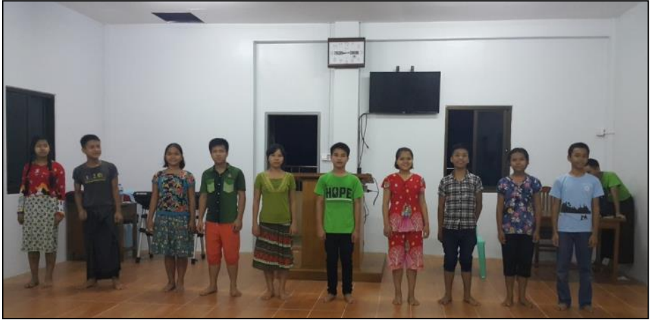
Some of the students showing how wide the new room is. It is over twice as long as it is wide, so this gives you some idea of how much space is available.

involved in the 2018 #Move4Myanmar! God bless you all!!