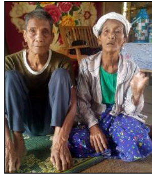
This couple is waiting to be in the Family Support Program

There are still many families waiting for help. $30.00 per month is all it takes to help feed a poor family.