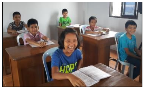
Some 8th grade students using the new space

Construction began in mid-May and was completed just last week in mid-July. The new space looks great!