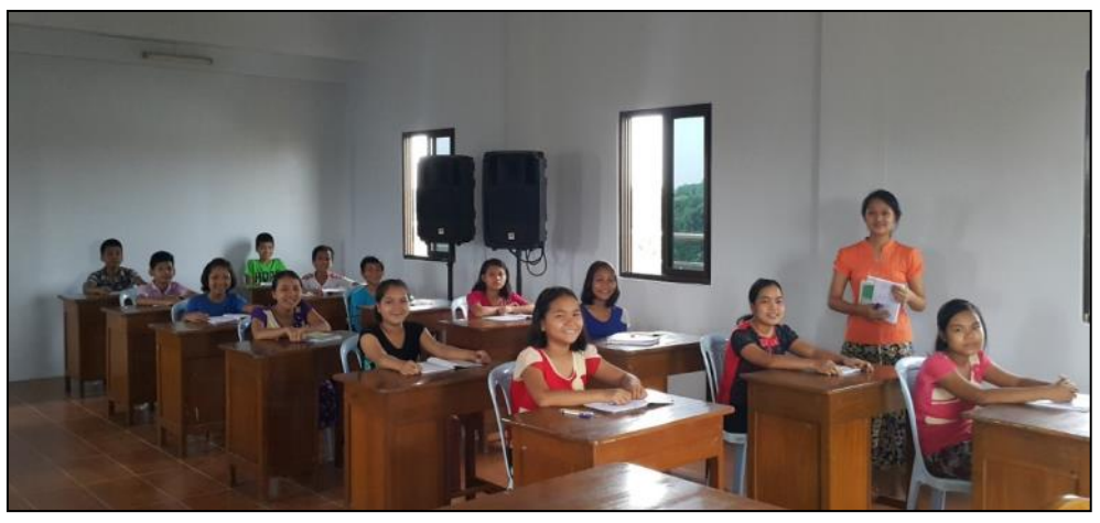
Everyone loves the new 4th floor!