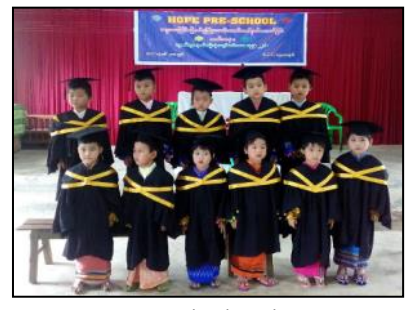
2018 Preschool Graduates

On May 7th, Hope Preschool held its 6th annual graduation ceremony. This year thirteen students graduated and are able to start kindergarten. Twenty students returned in June for the new academic year, along with nineteen new students.