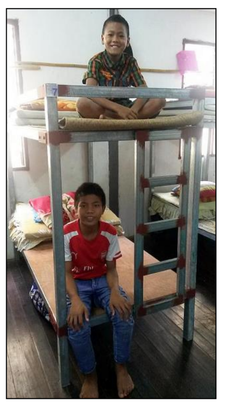
The new bunk beds will last for many years.

Last issue we told you that we needed new bunk beds in order to have beds for all of the new students. Thank you for responding! Palal was able to purchase custom made steel frame bunk beds, and now every student has a bed of their own. These beds are very well