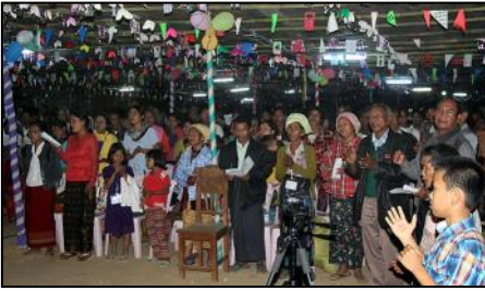
Christians from all over worshipping God together in freedom! The youth choir did a wonderful job of setting up and decorating the shelter.

est convention yet, with over seven hundred people attending.