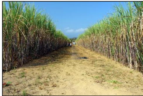
Looking west down "Main Street"

Many people are coming from great distances to look at our amazing crop, taking photos and asking how the crop was planted, cultivated, and so on.