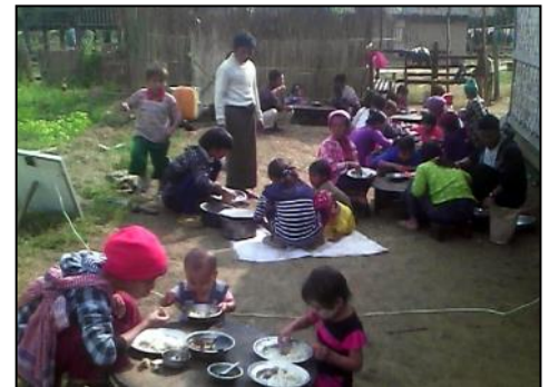
Believers in Tongkyaw Village enjoy a Christmas feast. Tongkyaw is very remote and poor. This is the best meal that some of these folks have ever had!

Thanks to your extremely generous outpouring of support last fall, we were able to provide Village Christmas Meals to a record number of people in December! Our goal was to provide meals for 30 villages. However, because of your generous gifts and a favorable exchange rate, we were able to provide meals for 38 villages! Praise God!