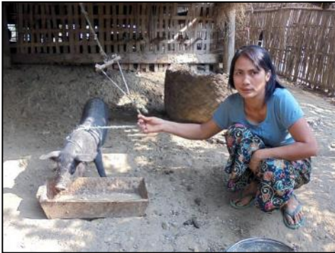
This widow from Tingkaya Village received one of the first piglets in our 2016 Piglets Project.