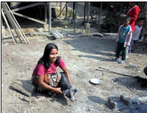
A young mother in Bokkan Village is very happy to be part of our 2016 Piglets Project

We hope that better education and training will help the families to maintain and expand their livestock herds. Also, we believe that partnering with them to help other poor families in their villages will help sustain this project for the long term.