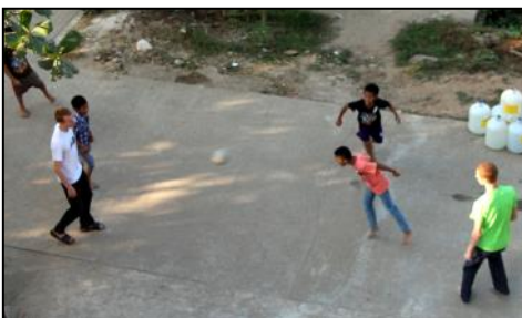
Playing soccer in the street

The children in the school are perhaps the most joyful people I have ever met, and always looking for opportunities to serve. They simply overflowed with life, wanting to play badminton or ping-pong or jump rope for hours in