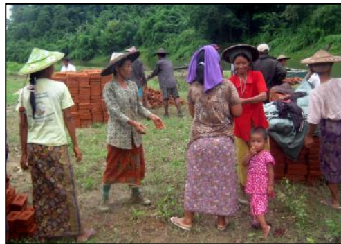
The ladies of Joljam Christian Church helping to unload bricks from the boat. These ladies and many others helped out with every step of the construction process.

Joljam Village is so remote, the only way to reach it is by boat, so all of the construction materials had to be transported up the river from Homalin. Everyone in the church helped out, even the ladies and young children. When it was finished it was the only brick and concrete building for several miles around!