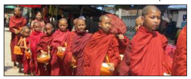
A group of young Buddhist monks out collecting their daily alms

Please pray for our team as they prepare mentally, physically, and most of all spiritually, for this intense day of ministry. We know that Satan will do all in his power to thwart our plans and prevent these children from hearing the Word of God. There are several Buddhist monasteries and compounds in the